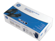
100 Pieces Box