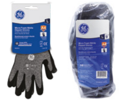
Hanging Card 12-Pack