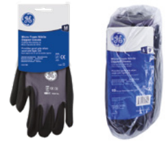
Hanging Card 12-Pack

• Longer cuff for better protection and comfort